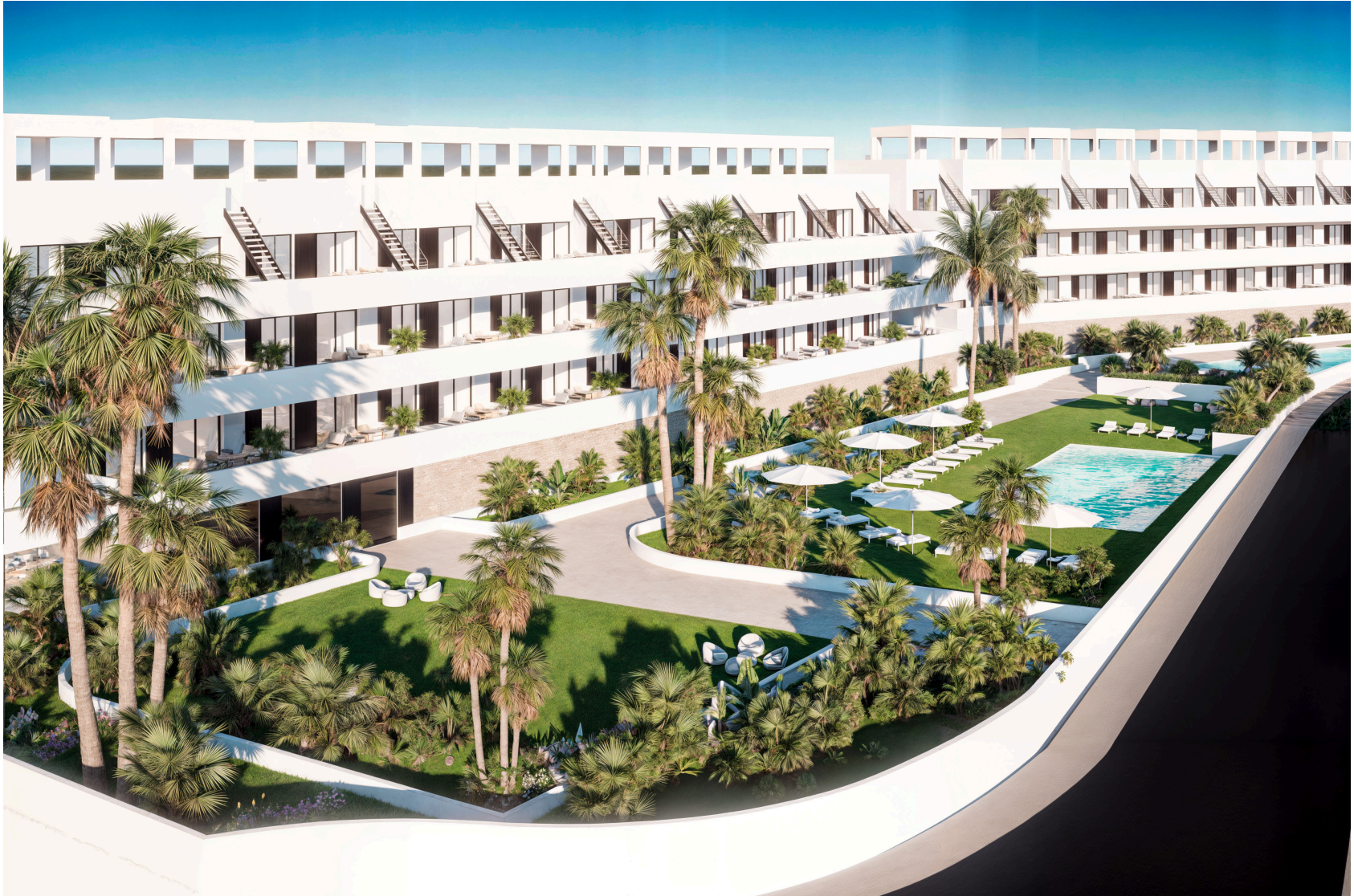
Private residential complex with spacious communal areas.