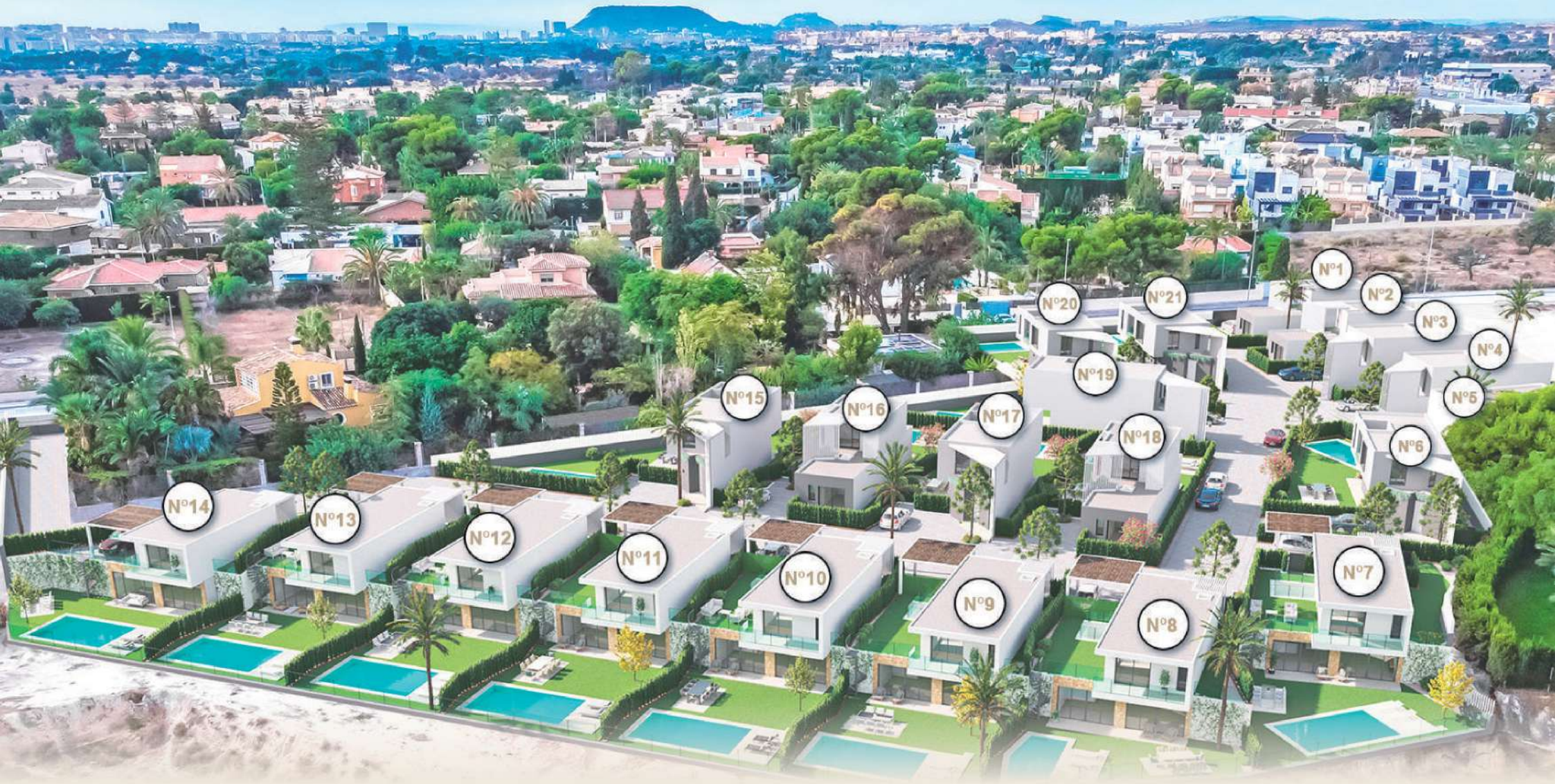
Air view of the urbanization