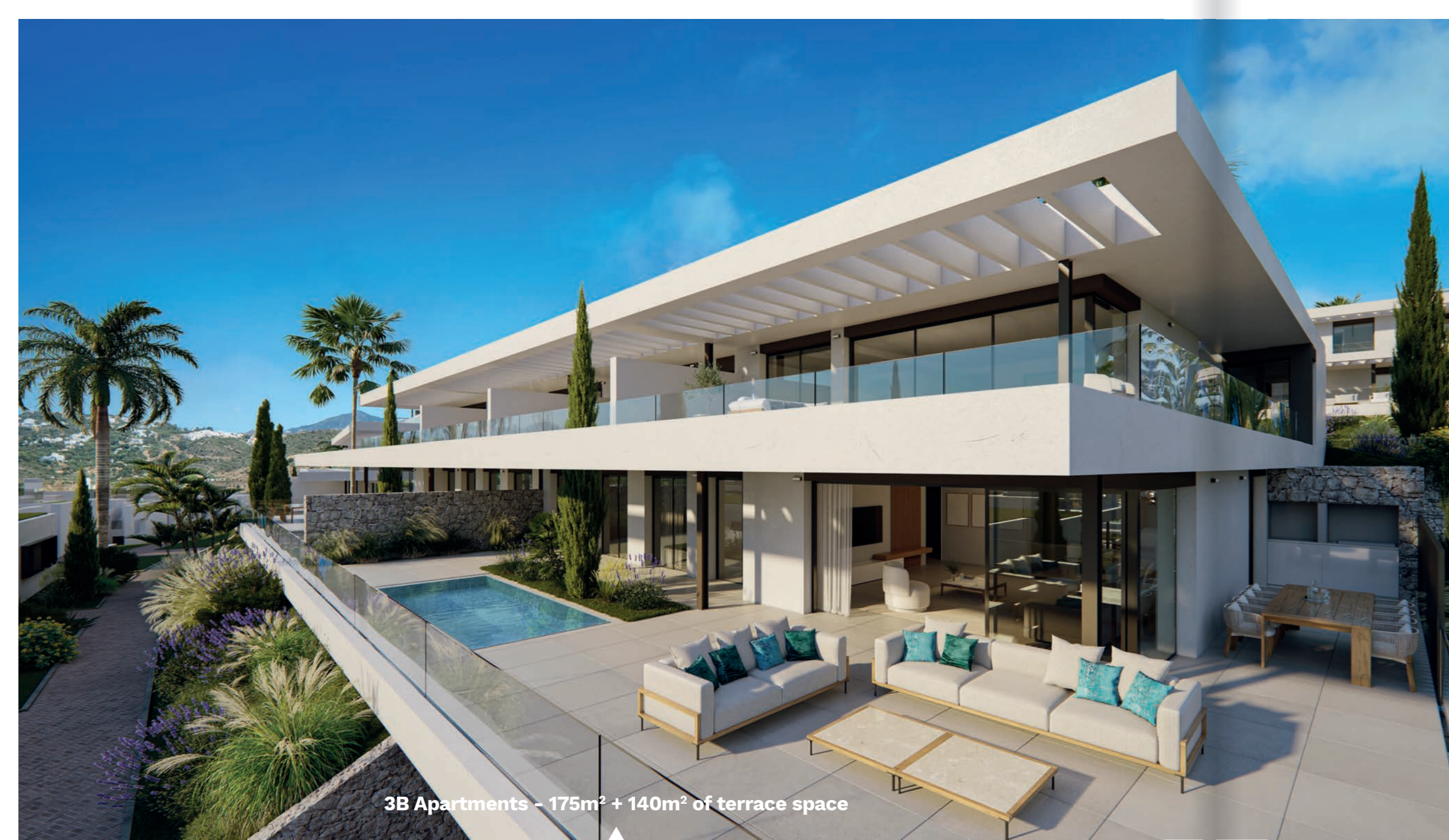
3B Apartments - 175m 2 + 140m 2 of terrace space