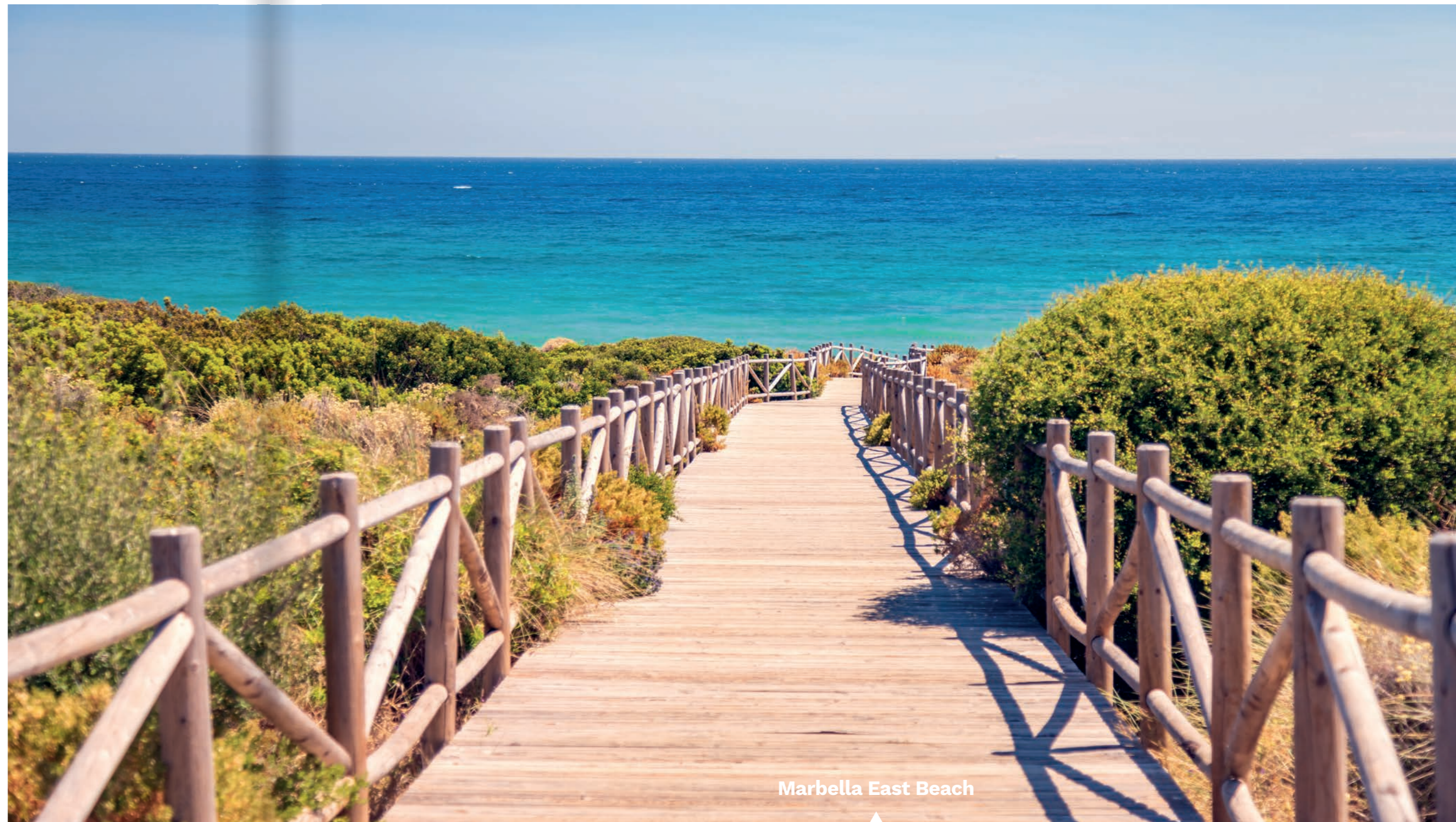
Marbella East Beach

An excellent location to enjoy a relaxed and healthy lifestyle with the best beaches within walking distance.