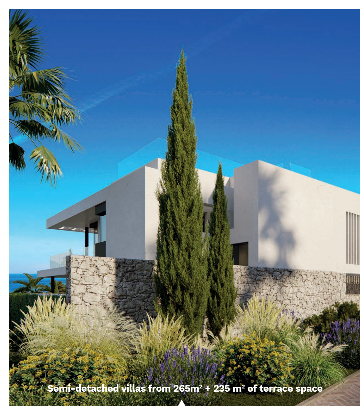
Semi-detached villas from 265m 2 + 235 m 2 of terrace space