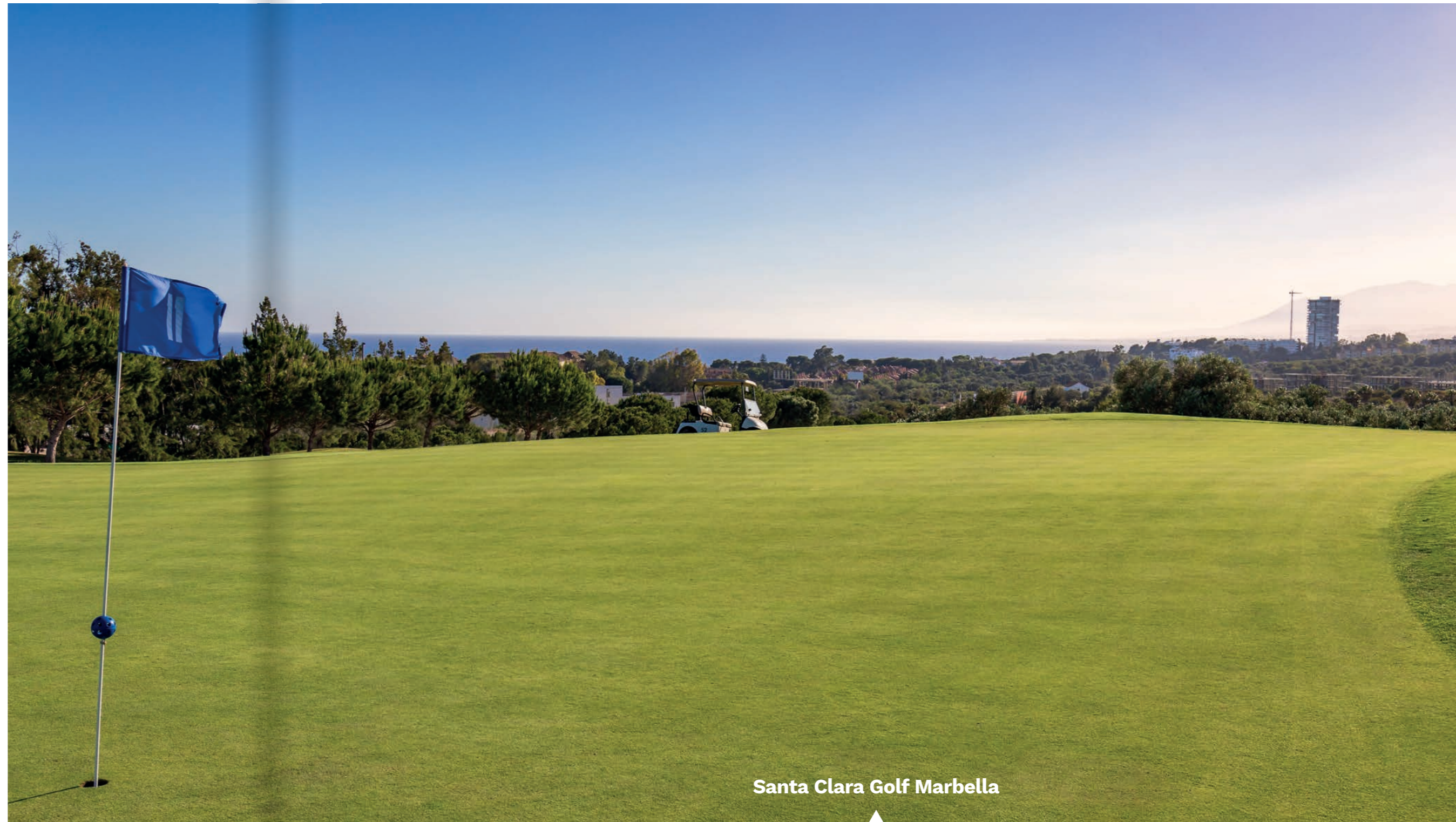
Santa Clara Golf Marbella

This sports facility also has a wide range of services such as a clubhouse, restaurant, sports shop, a fleet of buggies available to players, a reading area and much more.