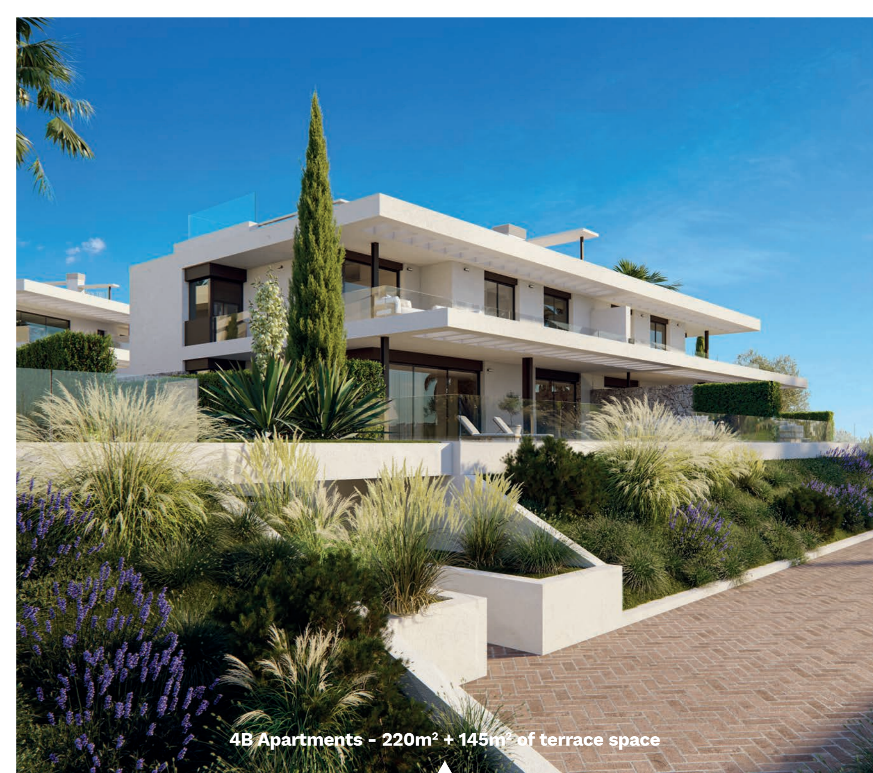
4B Apartments - 220m 2 + 145m 2 of terrace space