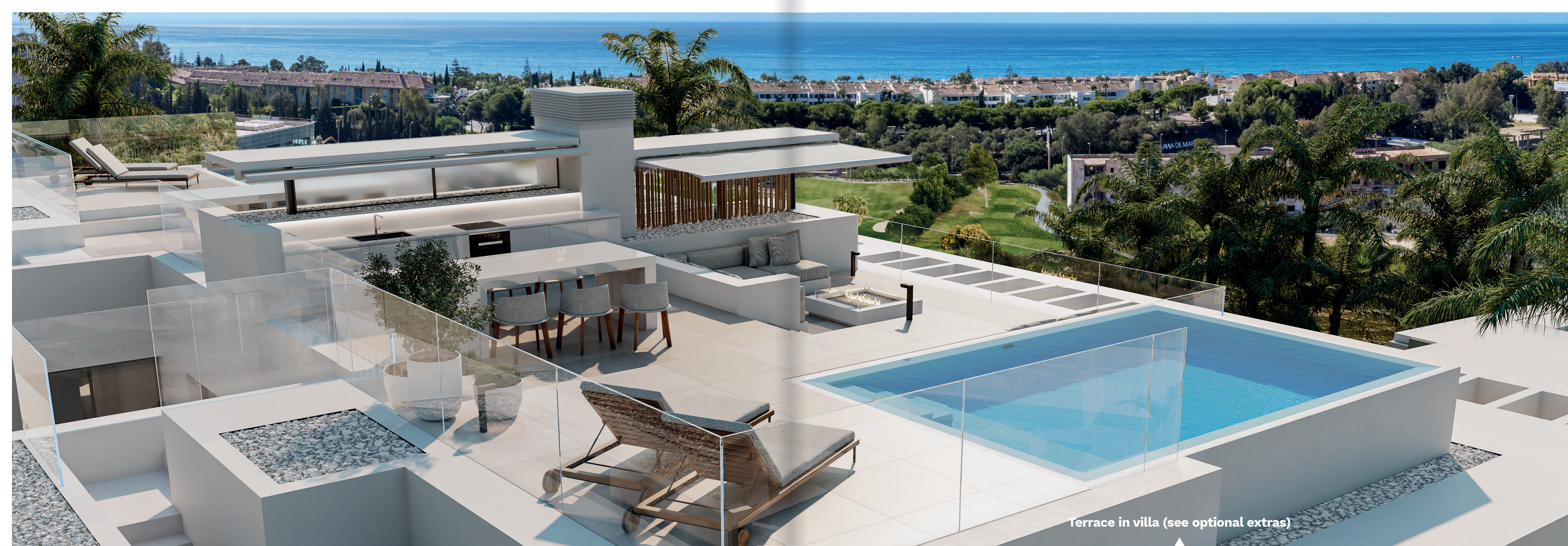
Terrace in villa (see optional extras)