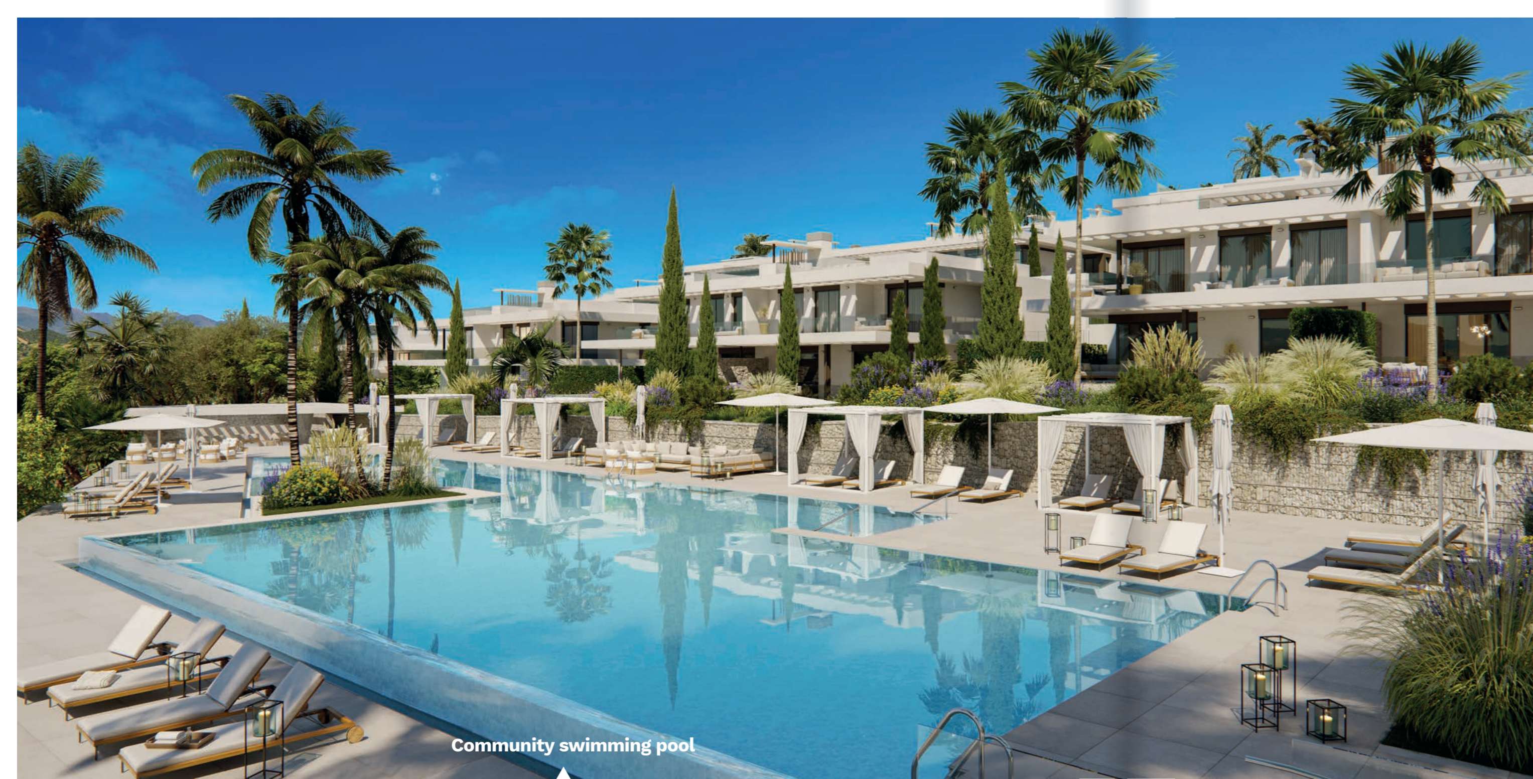
Community swimming pool