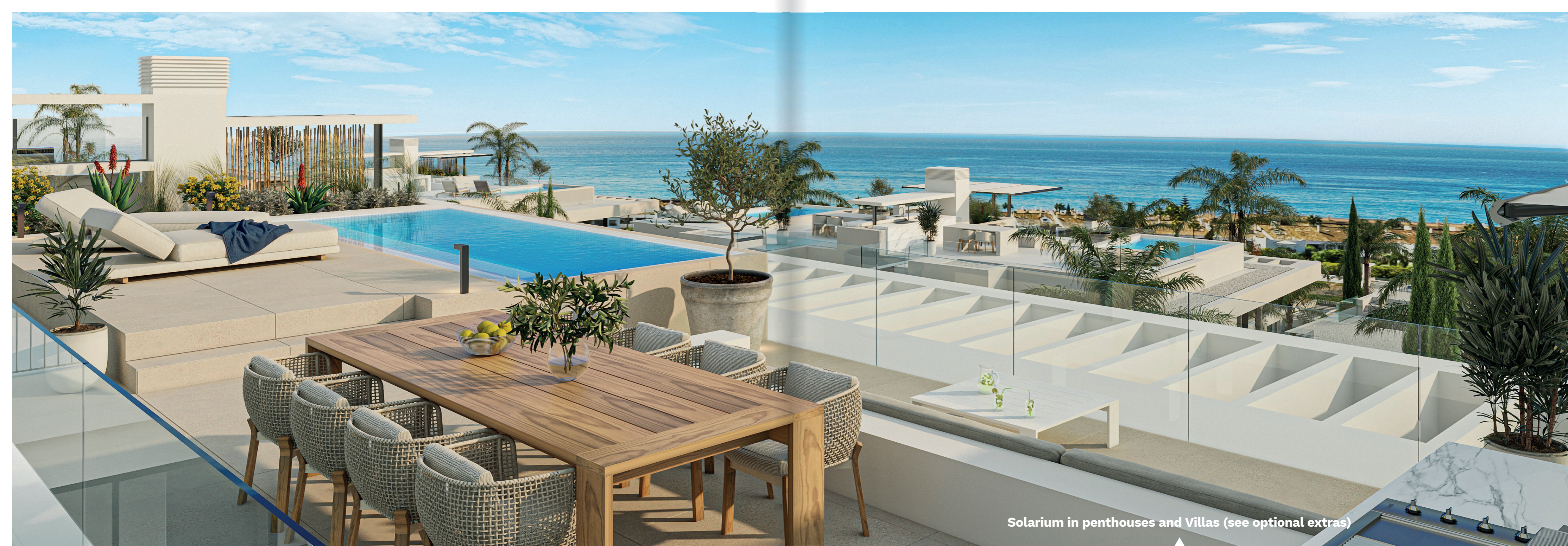
Solarium in penthouses and Villas (see optional extras)