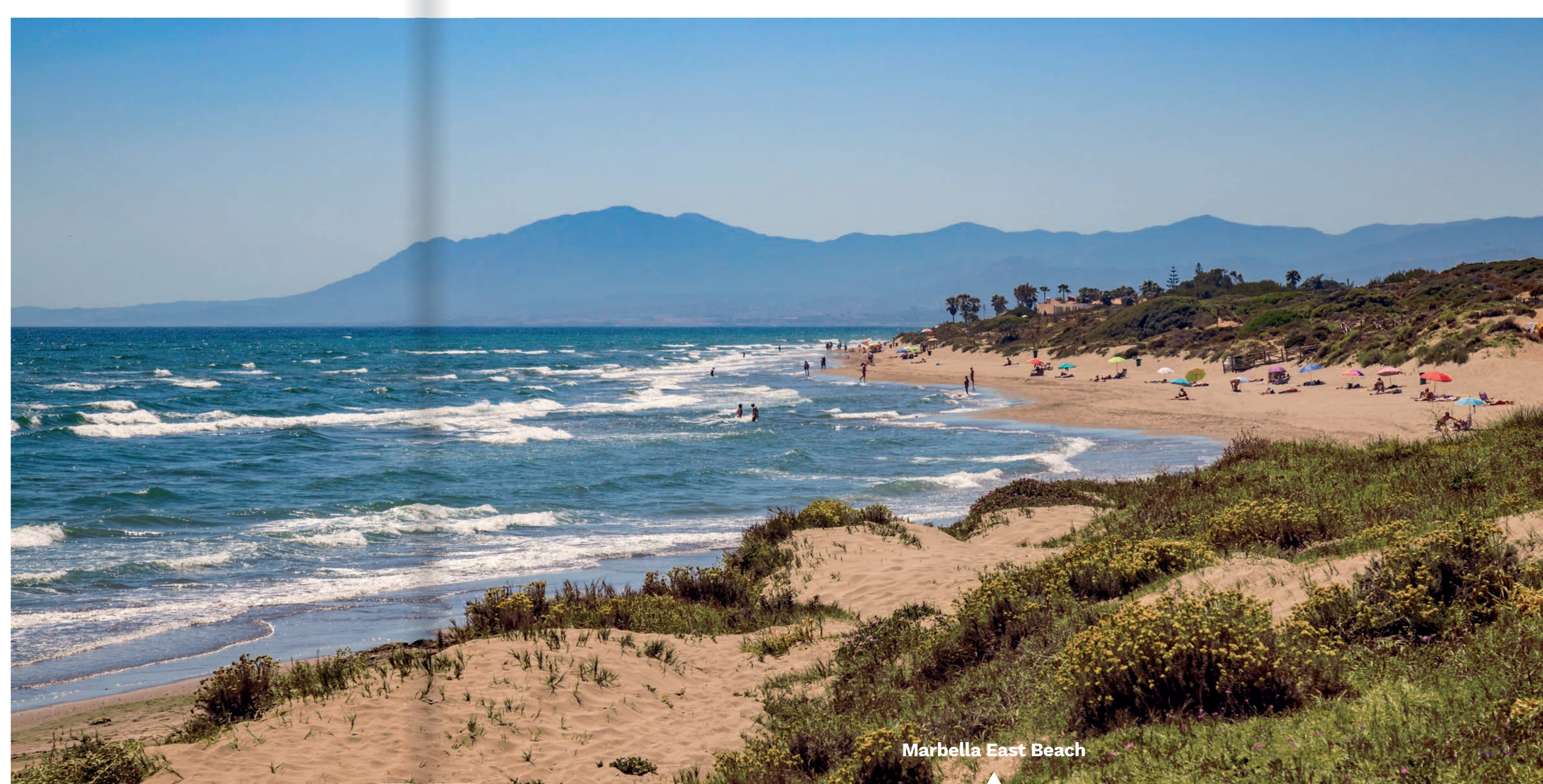
Marbella East Beach