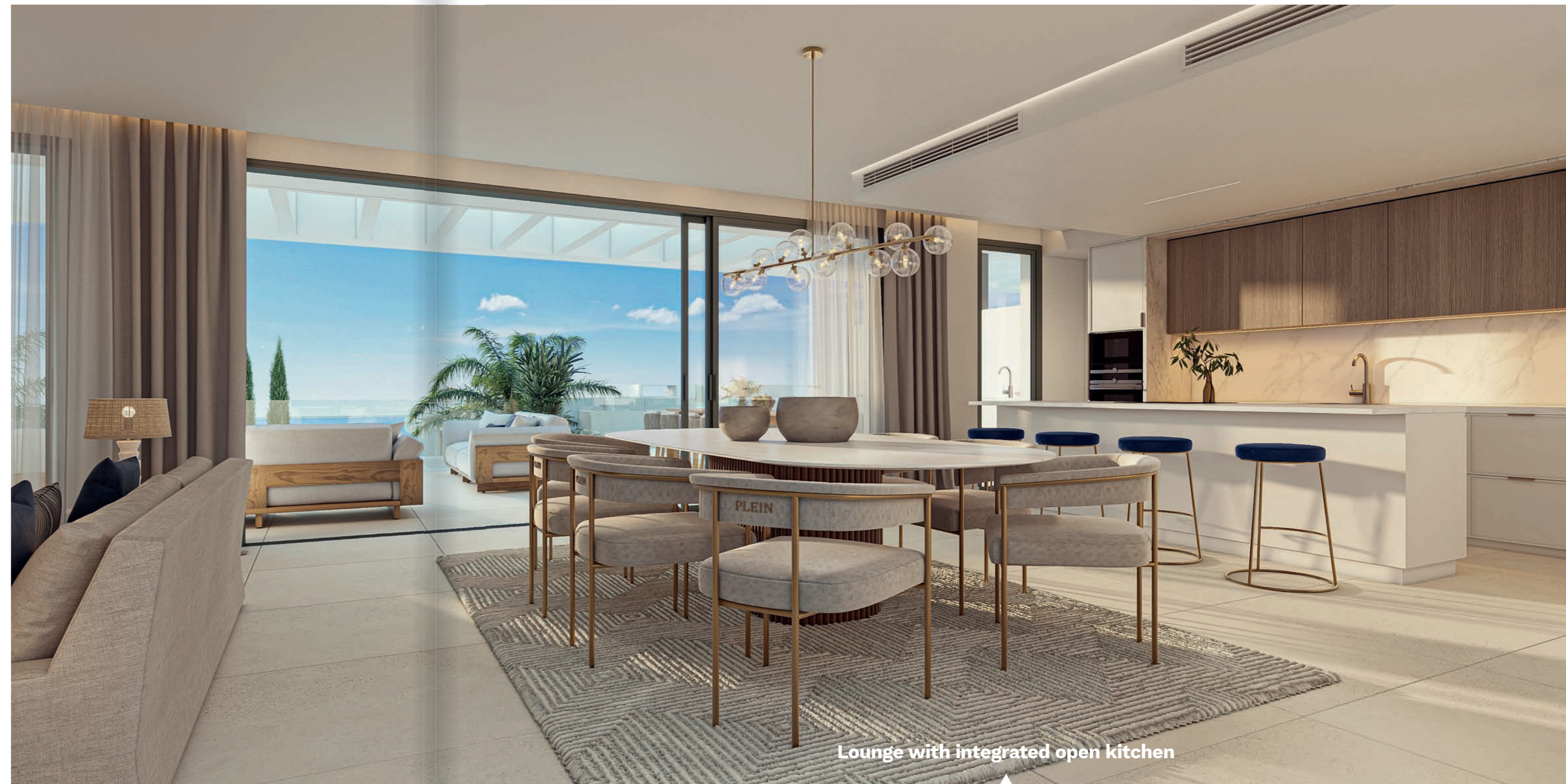
Lounge with integrated open kitchen

* For further information, please consult our personalisation catalogue.