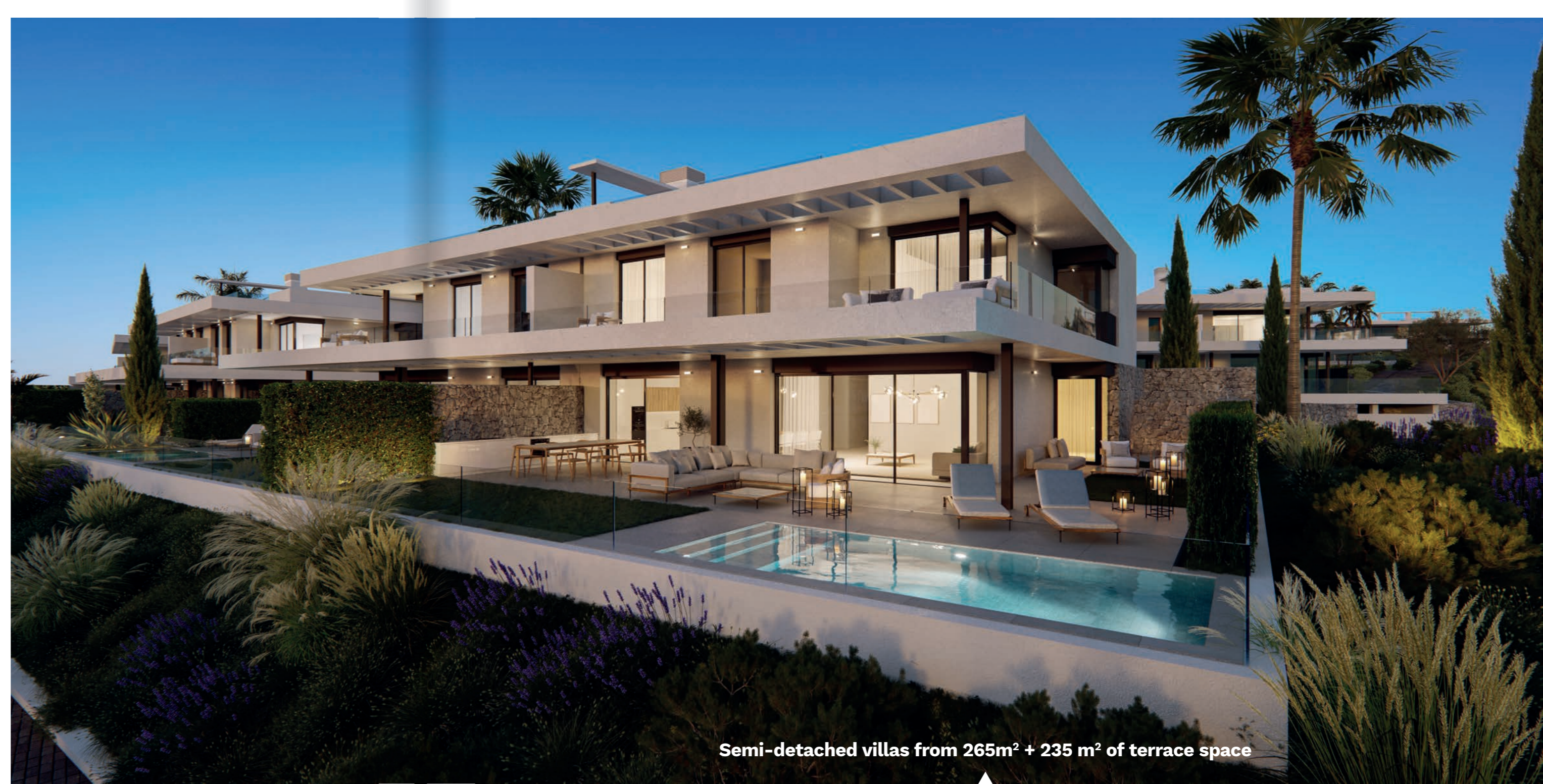
Semi-detached villas from 265m 2 + 235 m 2 of terrace space