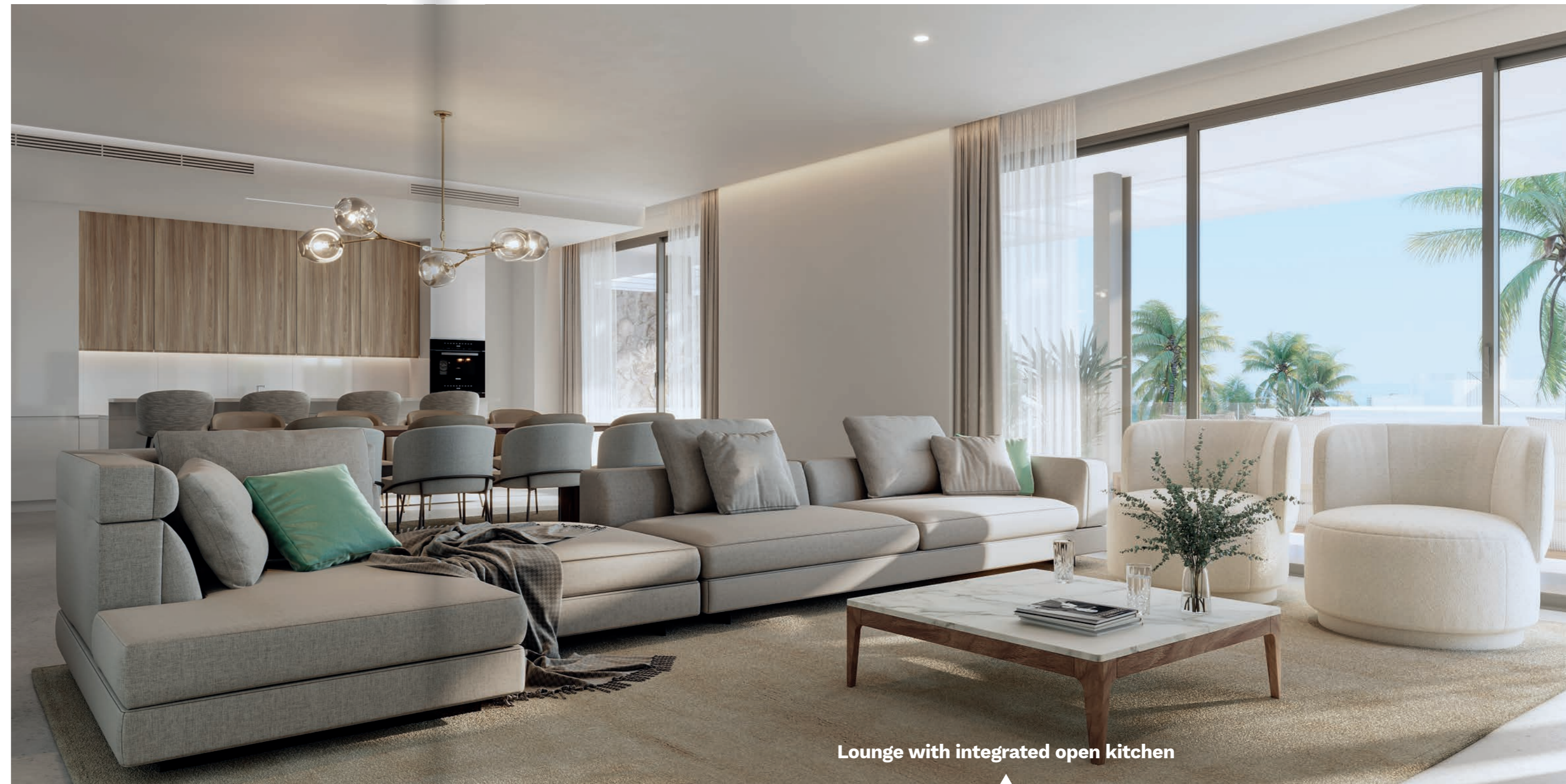
Lounge with integrated open kitchen

Energy consumption certification – A standard