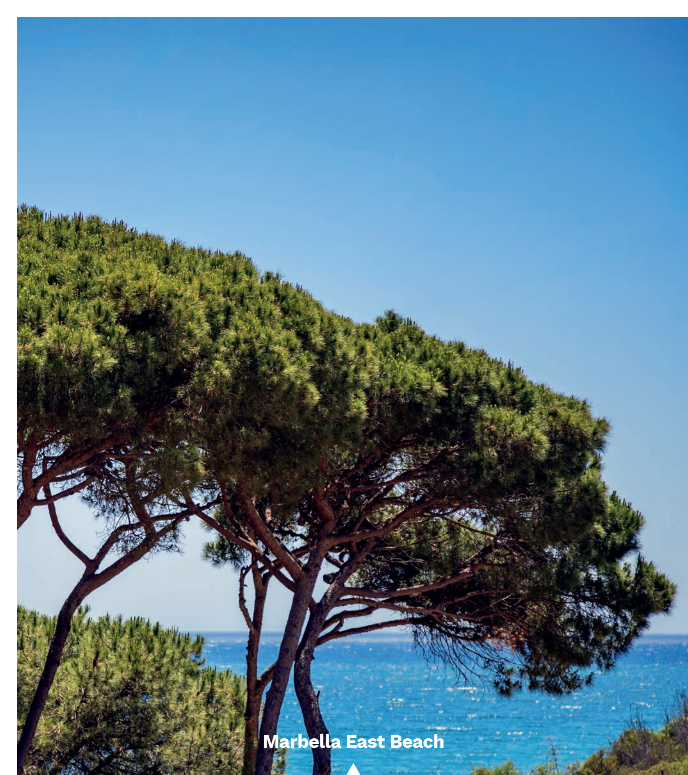
Marbella East Beach