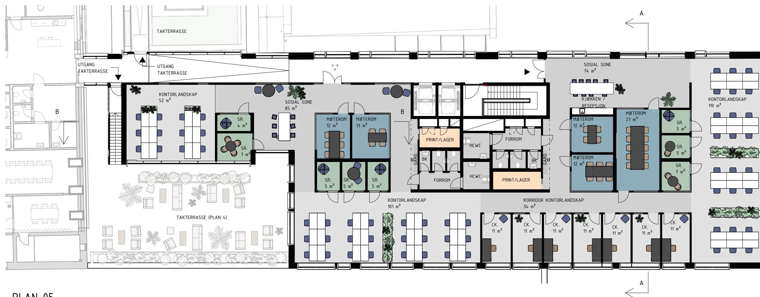
PLAN 05 1:200