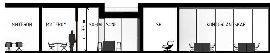
SNITT B-b 1:200