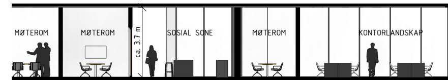
SNITT B-b 1:200