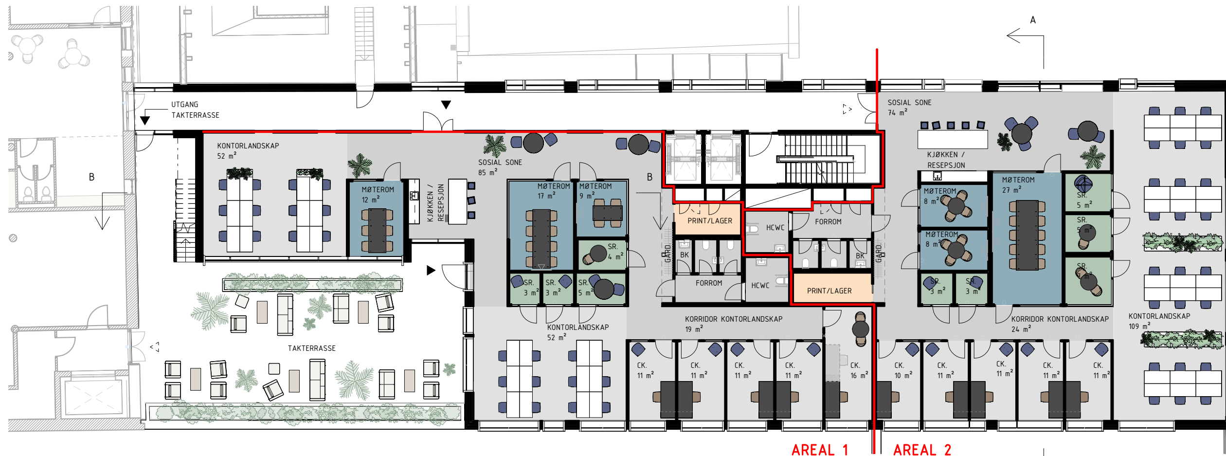
PLAN 04 1:200